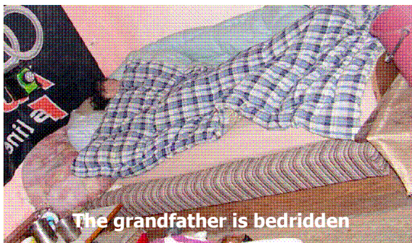
The grandfather is bedridden

The medical situation of the family is also worsening: the grandmother is 56 years old and is suffering from angina (medical certificate no.282/19 Jan 2011). The husband has chronic bronchitis and chronic hepatitis (medical certificate no.281/19 Jan 2011).